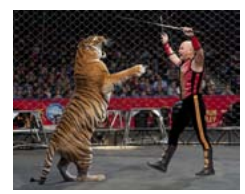
With an assist from IHB, the Ringling Bros. and Barnum & Bailey Circus comes to Chicago.