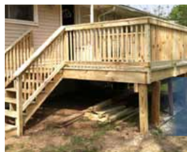
Railroaders made a colleague's summer more enjoyable and comfortable by building a deck during a weekend in May. IHB supplied funding for material.