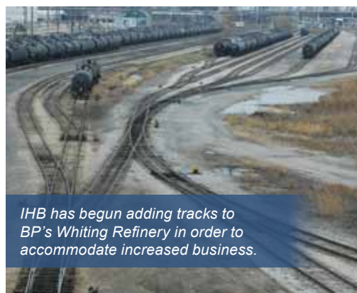
IHB has begun adding tracks to BP's Whiting Refinery in order to accommodate increased business.