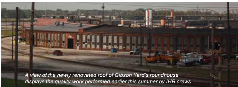
A view of the newly renovated roof of Gibson Yard's roundhouse displays the quality work performed earlier this summer by IHB crews.